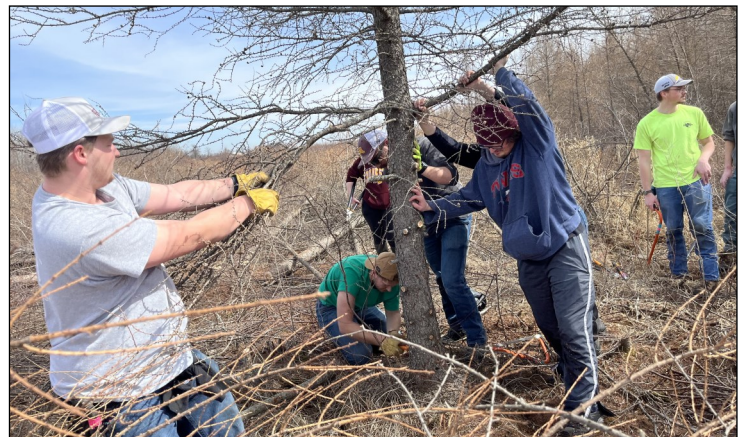
Part of the crew taking down a big tamarack tree that was in the middle of the unit.