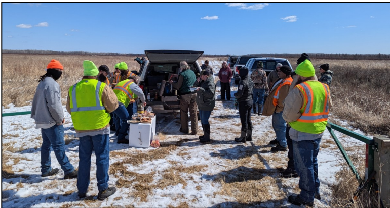
The crew enjoying a nice warm meal on the cold April day after a long day of brush cutting.

Several clusters of grouse night roosts were observed while working on the project showing that the area is being used as roosting habitat and MSGS efforts over these years is paying off. The volunteer hours will be used for matching grant money to do large habitat improvement contracts on the Palmville WMA.