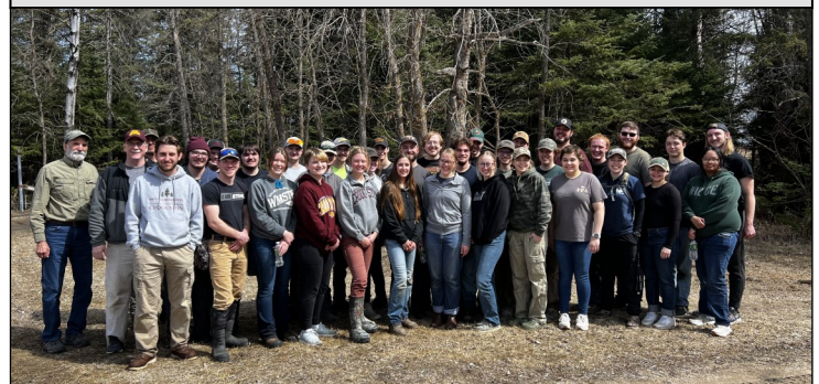
All 39 volunteers after a hard days work enhancing habitat for the firebird on Palmville WMA in the NW Region.