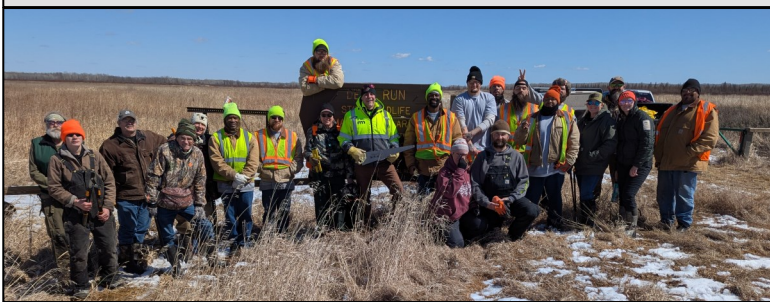
Group photo of all the volunteers who made it out to the brush cut day. Thank you to everyone who made it out to support sharp-tailed grouse.